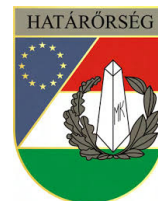
Hungarian Border Guard