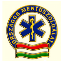
National Ambulance Service